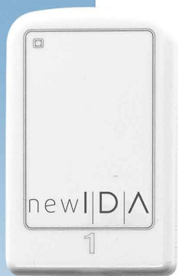
Size 1 active area: 20x30 mm